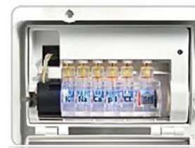
Free maintenance electrodes