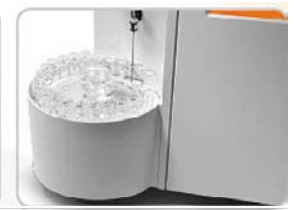
Auto Sampler option